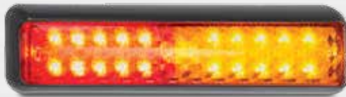
Part Number 200BSTIM - Multivolt 12-24V, Blister single 200BSTIMB - Multivolt 12-24V, Bulk boxed