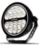
RDL6700LK 7" LED Driving Light 10-30V Round 74W Combination Beam