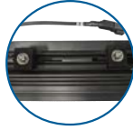
Bottom Rail Mount