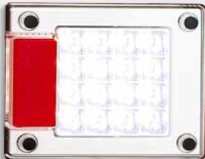
Part Number 460WMB - Multivolt 12-24V, Bulk poly bag