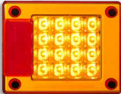
Part Number 460AMB - Multivolt 12-24V, Bulk poly bag