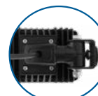
Dual Mounting Options