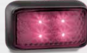
Part Number 35PM - Multivolt 12-24V Blister single