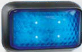
Part Number 35BM - Multivolt 12-24V Blister single