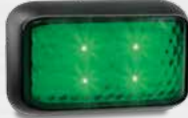
Part Number 35GM - Multivolt 12-24V Blister single