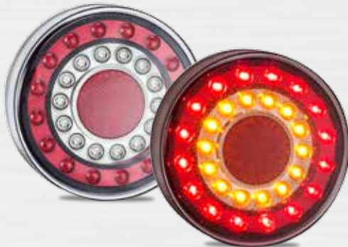
Part Number MaXilamp1XC - Multivolt 12-24V, Blister single