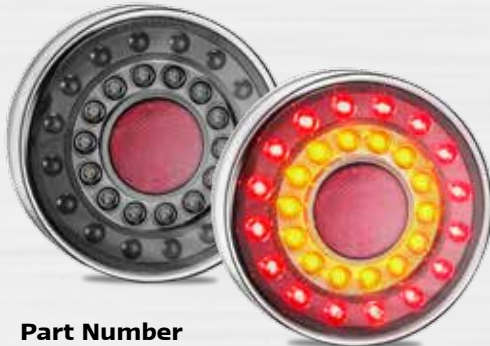
Part Number MaXilampC1XCE - Multivolt 12-24V, Blister single