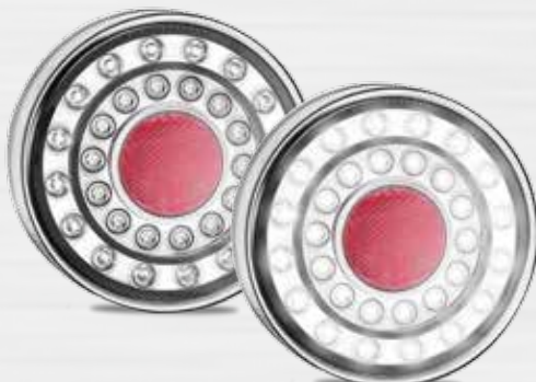
Part Number MaXilamp1XCWE - Multivolt 12-24V, Blister single