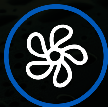
High Power Motor

The Aerpro APDB1 Metal Super Power Dust Blower is a compact, high-performance cleaning tool with a sleek metal body, adjustable airflow up to 130,000 RPM, and an LED screen for real-time status updates. Powered by dual lithium batteries and USB-C charging, it offers an eco-friendly alternative to compressed air cans for precision cleaning of electronics, car interiors, and more.