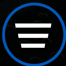
3 Speed Setting