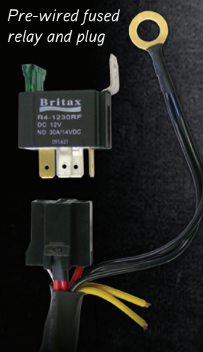
Pre-wired fused relay and plug