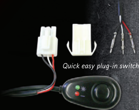
Quick easy plug-in switch