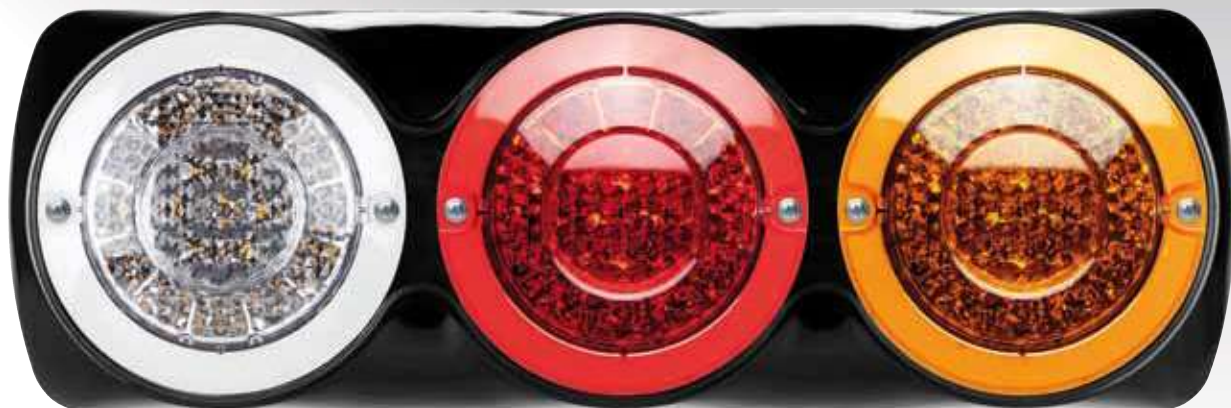
Shown fitted to optional triple bracket, available in black or chrome.