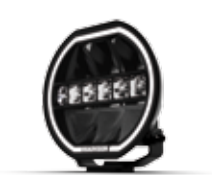
RDL8800C 8" LED Driving Light 10-30V 132W Combination Beam

Elevate your larger 4WDs and Trucks with Roadvision's S8 Stealth Series Driving Lights. With contemporary black mounting hardware and innovative dual-colour HALO DRL, these lights feature a stylish bezel-less design. The 24 x 6W Cree LEDs illuminate with an impressive 7937lm per light, projecting a remarkable 768 metres (1086 metres per pair) beam penetration at 1 lux, thanks to Roadvision's Thermal Management Technology. Built to withstand harsh conditions, the S8 series boasts a robust yet lightweight aluminium housing and a durable polycarbonate lens. Redefine your driving experience with the S8 series' tough aesthetic and unparalleled lighting prowess. Meanwhile, our 8" light with a low-profile bracket optimises your bull bar space. Embrace the benefits of 9" light output while enjoying a sleeker, more rugged appearance, unlocking your vehicle's full lighting potential with style and functionality.